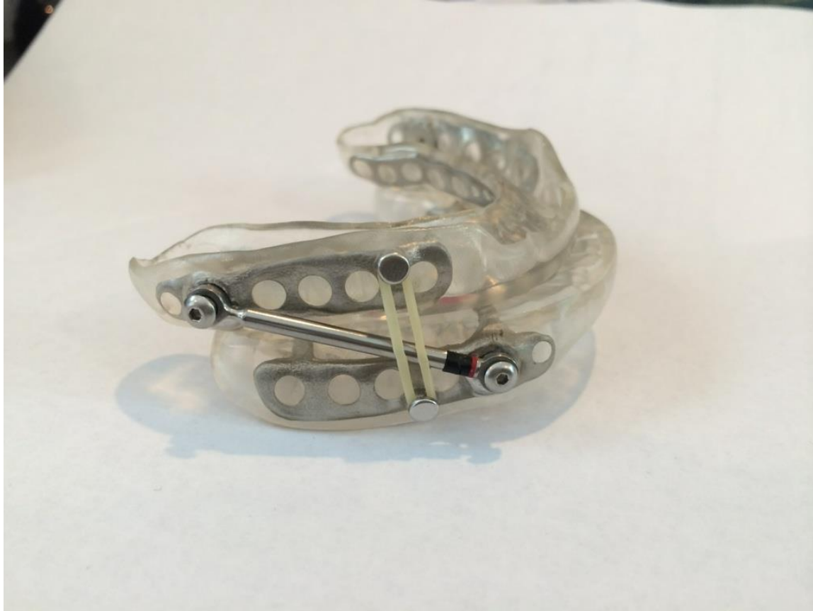
This is the device put together with rubber bands